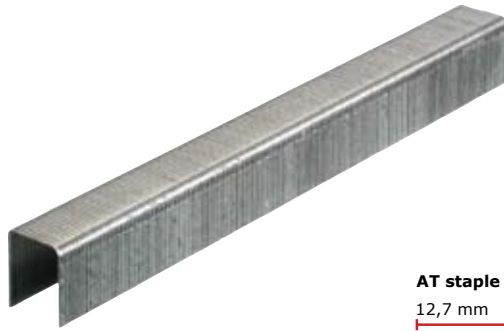
AT staple 12,7 mm